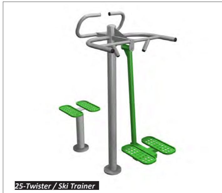
25-Twister / Ski Trainer